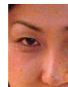
Photo with 'noise'

For a clearer print from digital camera images, this feature removes 'noise' from the data to give you prints with brilliant clarity.