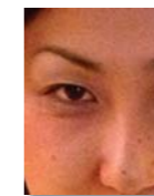
Digital Camera Correction