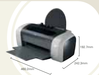
EPSON Stylus™ C65 Weight=Approx. 4.41kg

For enquiries, contact your nearest EPSON sales representatives: INDIA - (91) 802-532-1266-70, CALCUTTA - 287 1355/56, CHENNAI - 820 3941/42, MUMBAI - 825 7286, NEW DELHI - 644 7201/23 INDONESIA - (62) 21-572-3161 MALAYSIA - (60) 3-562-88288 PHILIPPINES - (632) 813-6567 SINGAPORE - (65) 6337-7911, (65) 6586-3111 THAILAND / INDOCHINA - (662) 670-0680