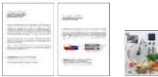
*1 Black Text & Graphics *2 Colour Text & Graphics *3 Photo 4R (4 x 6)

** To use USB port, your PC must conform to PC98 specifications, and have Windows preinstalled. Consult the documentation provided with your PC for further information about USB connectivity. Note also that printing errors may occur if non-standard cables or more than 2 USB hub connections are used.