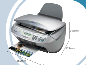
EPSON Stylus™ CX6500 Weight=Approx. 9.0kg

For enquiries, contact your nearest EPSON sales representatives: INDIA - (91) 802-532-1266-70, CALCUTTA - 287 1355/56, CHENNAI - 820 3941/42, MUMBAI - 825 7286, NEW DELHI - 644 7201/2/3 INDONESIA - (62) 21-572-3161 MALAYSIA - (60) 3-562-88288 PHILIPPINES - (632) 813-6567 SINGAPORE - (65) 6337-7911, (65) 6586-3111 THAILAND / INDOCHINA - (662) 670-0680