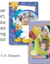
Photo Printing Utility

Easily print BorderFree™ photos and index prints, or enhance mobile phone images with EPSON PhotoQuicker ver 3.5.