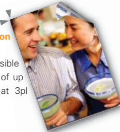
Photo quality prints are now possible on plain paper with a resolution of up to 5760x1440 optimised dpi at 3pl droplet.