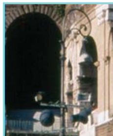
Greenish cast and loss of fine details