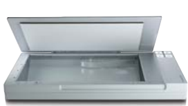
Landscape - opens sideways just like a photo copier

A new design also allows flexibility in placing the scanner either in portrait or landscape layout.