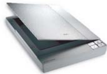
Portrait - traditional scanner position with buttons in front