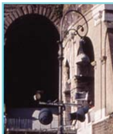
Sharp and clear image

Expect sharp and clear scans at a splendid definition of up to 3200 x 9600dpi resolution. Stunning yet natural colours reproduced with a 48bit colour depth brings out the best of your photos. Easily preserve and share precious moments by digitising all your photos.