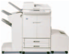
HP Color LaserJet 9500mfp, with optional stapler/stacker