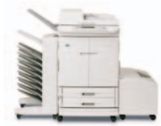
HP Color LaserJet 9500mfp with optional 8-bin mailbox

Colour printing and copying up to A3, scan-to-email, faxing 1 , document finishing and optional digital sending 2 features for demanding workgroups and departments. Advanced technologies and HP supplies yield consistent, impressive colour quality.