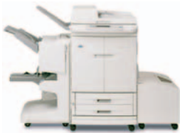
HP Color LaserJet 9500mfp, with optional multifunction finisher