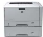
HP LaserJet 5200dtn printer