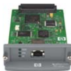
HP Jetdirect internal print server

Print professional documents and save time with the automatic two-sided printing unit (standard on the 5200dtn model).