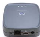
HP Jetdirect wireless external print server

Increase efficiency and security by installing the HP Jetdirect 635n IPv6/IPsec and Gigabit Ethernet internal print server in the available EIO slot.