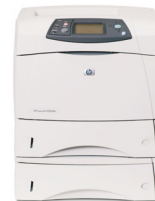
HP LaserJet 4250dtn