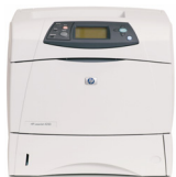
HP LaserJet 4250