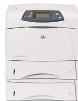
HP LaserJet 4250tn