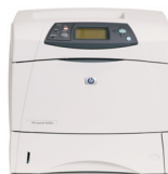
HP LaserJet 4250n