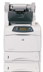
HP LaserJet 4250dtnsl