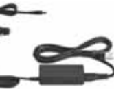
HP 65 W power adapter

C8257A Allows you to print while traveling from your car or even an airplane