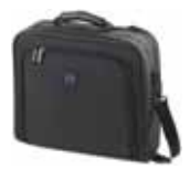
HP compact carrying case

C8232A Enables convenient portability for your printer and notebook and the flexibility to carry just the printer in its dedicated case