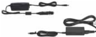
HP 12V auto power adapter

C8263A Effortlessly print on the go with this lightweight battery with easy snap-on installation