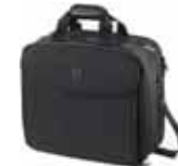
HP 2-in-1 executive notebook and mobile printer carrying case

CB006A Keeps your black or photo print cartridge safe when not in use