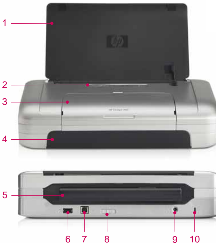
HP Deskjet 460cb mobile printer shown