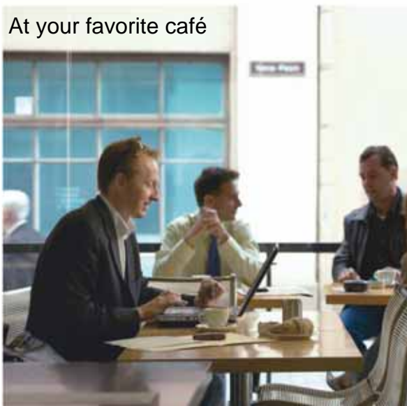
At your favorite café