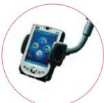
PDA holder for car