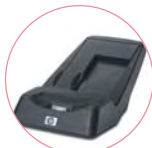
Desktop USB cradle/ charger