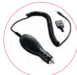
Automobile power adapter