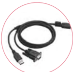
AutoSync Cable (USB and Serial)