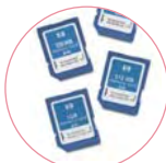
Mini SD/ SD memory cards