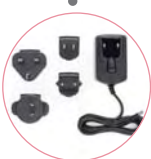
AC adapter kit-multimedia head