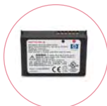
Standard/ Extended batteries