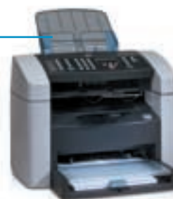
30-sheet Automatic Document Feeder (ADF)