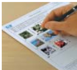
HP Photo Proof Sheet