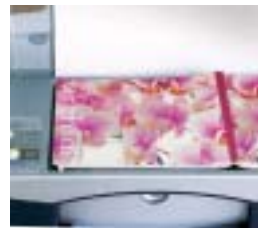
Versatile flatbed scanning