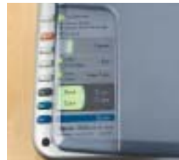
Easy and quick 'one-touch action' keys

Easy to use and intuitive, HP Memories Disc Creator software 6 turns your digital image collection into a multimedia slideshow. Simply burn the complete project onto a CD and it will play on virtually any PC or VCD/DVD player.