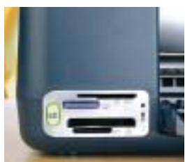
Multi-slot memory card reader 4