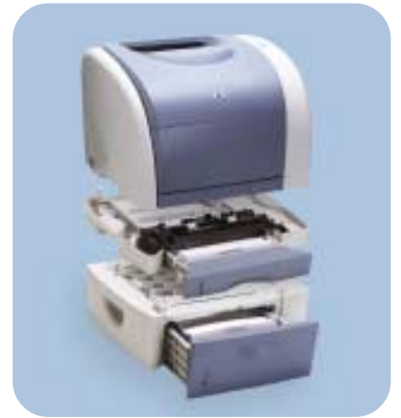
hp color LaserJet 1500 printer series with optional 250-sheet 2nd paper tray †† and 500-sheet 3rd paper tray ††

The HP Color LaserJet 1500 printer series is so compact and light, it can even be placed right on your desktop! This saves you valuable desktop real estate and allows greater convenience. What's more, it supports the Windows 98/Me/2000/XP and Macintosh 9.x (and higher) platforms.