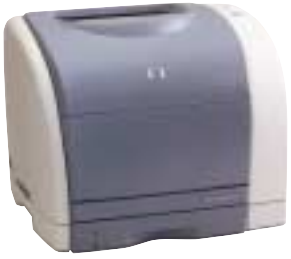
hp color LaserJet 1500 printer series