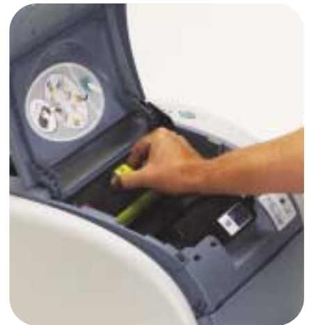
single-door full access to low toner cartridges