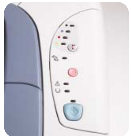
see printing supplies status at a glance on the simple control panel