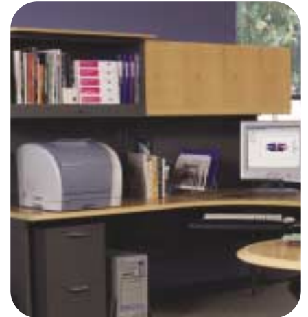
compact design that fits nicely on your desktop

Readers' Report Card gives HP printers one of their first-ever A+ rating and rate top grade for reliability and customer satisfaction for the 11th straight year. (August 2002 PC Magazine)